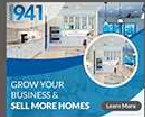
300 x 250 - Inline Rectangle