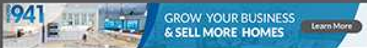
728 x 90 - Leaderboard