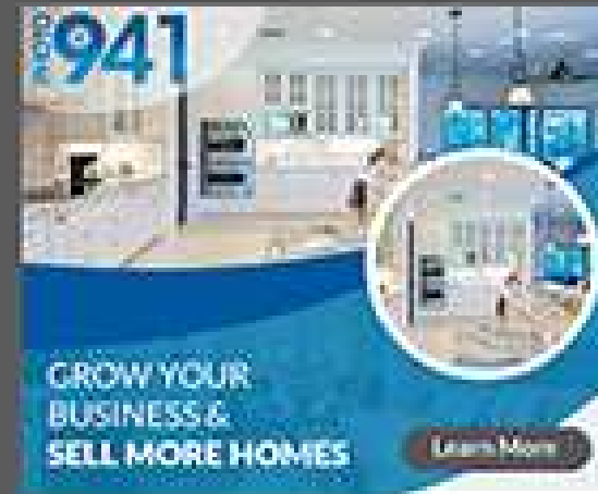
336 x 280 - Large Rectangle