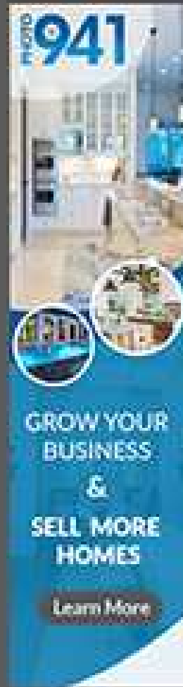
160 x 600 - Wide Skyscraper