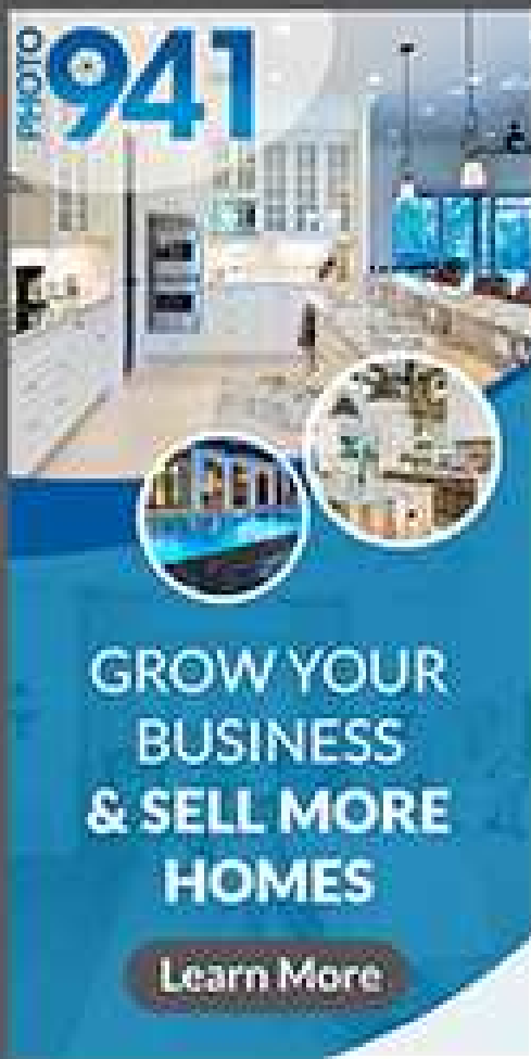
300 x 600 - Half-Page Ad